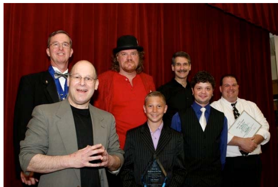
Close Up Magician of the Year Performers