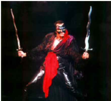
Ayala was an incredible opening to the Saturday evening show at the Missouri Theatre